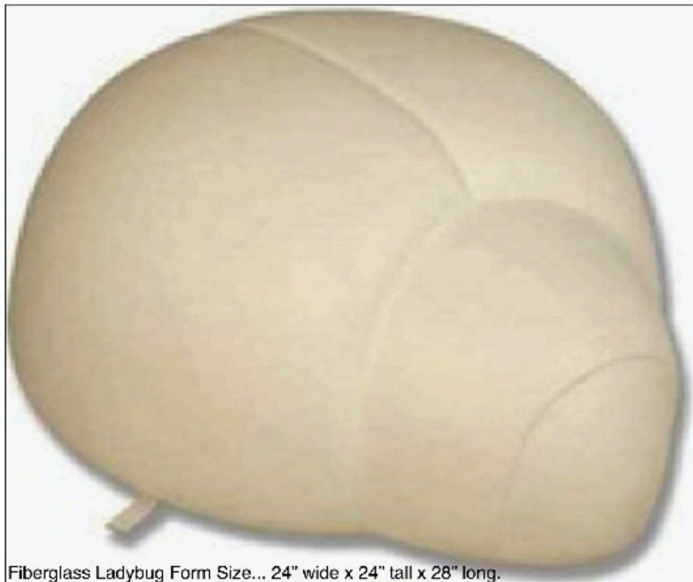
Fiberglass Ladybug Form Size... 24" wide x 24" tall x 28" long.